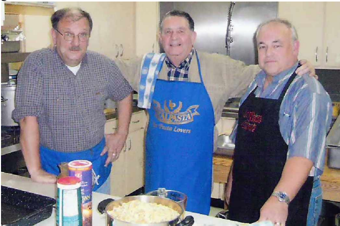
Kitchen Crew hard at work