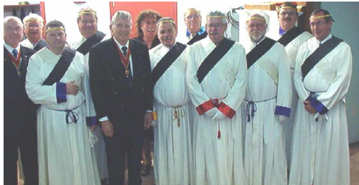
Members of the 17 th Degree Team from Sudbury

On Saturday Oct. 14 th 2006 members of the North Bay Rose Croix travelled from Sudbury to conduct the 17 th degree during the annual reunion.